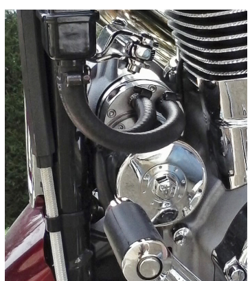
This mounting orientation may be required on some Sportster models

Some Sportster models may require rotating the mounting of the 4701 offset oil filter adapter 180 degrees, placing the hoses above the filter (see photo at right). In these installations, the anti-rotation device is not required, and you may now skip to step 16.