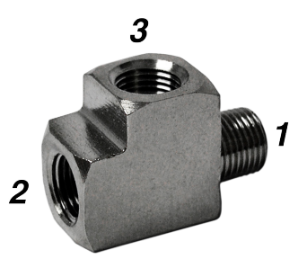
Street-tee pipe fitting

NOTE : 1/8" pipe threads should be installed to finger-tight, and then tightened an additional 2-to-2.5 turns.