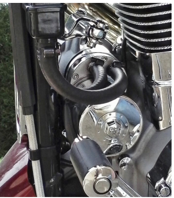
This mounting orientation may be required on some Sportster models

Some Sportster models may require rotating the mounting of the 4701 offset oil filter adapter 180 degrees, placing the hoses above the filter (see photo at right). In these installations, the anti-rotation device is not required, and you may now skip to step 16.