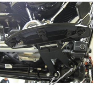
REMOVE THESE LOWER BOLTS