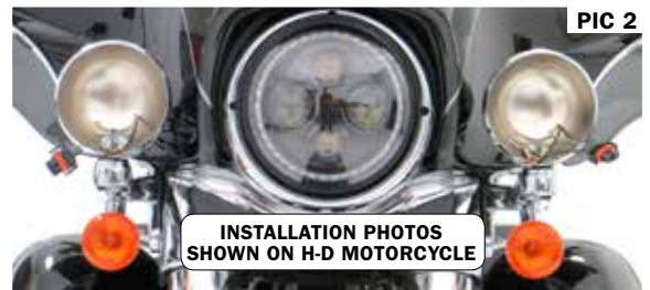
INSTALLATION PHOTOS SHOWN ON H-D MOTORCYCLE