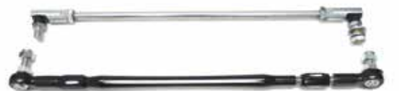
ADJUST JAM NUTS