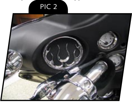
STEP 4 Repeat process for opposite side.

ATTENTION! The adhesive will not bond correctly if applied at temperatures less than 50°F. Do not attempt this installation in temperatures less than 50°F.