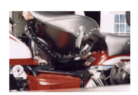
Enjoy the Comfort of your new Mustang Seat!

These steps are guidelines to help you install your new Mustang product. If you need further assistance, please call us at 800-243-1392, Monday through Friday 9:00 - 5:30 Eastern, or send an email to questions@mustangseats.com, or visit our website at www.mustangseats.com. For care and maintenance of our seats, please go to our website under "Support". Ref part #75970, 75972, 79140, 79141