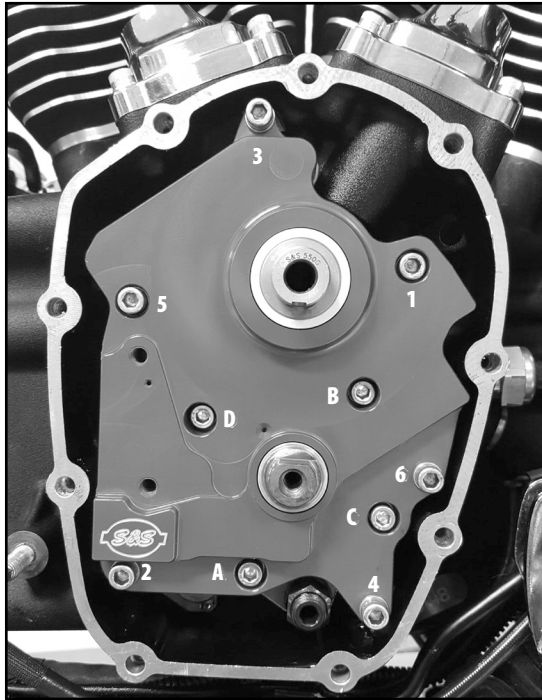
Picture 3: Cam Support Plate Screws (1-6) and Oil Pump Screws (A, B, C, D)