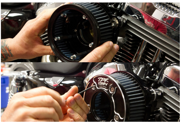
Apply anti-seize to threads of plug cap or v-stack and install hand tight.

Install TBR air filter and face plate. Tighten the five socket head cap