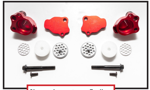
Clean & inspect new Feuling components for assembly