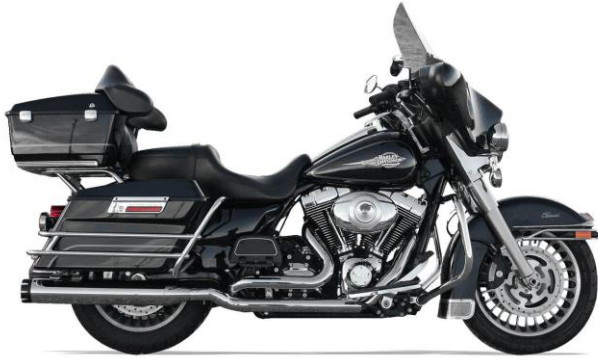
Shown with 1F740 Mufflers and BE40T-2 End Caps

CAUTION: WRAPPING of Pipe with Heat Tape may adversely affect the pipe & will Void Warranty!