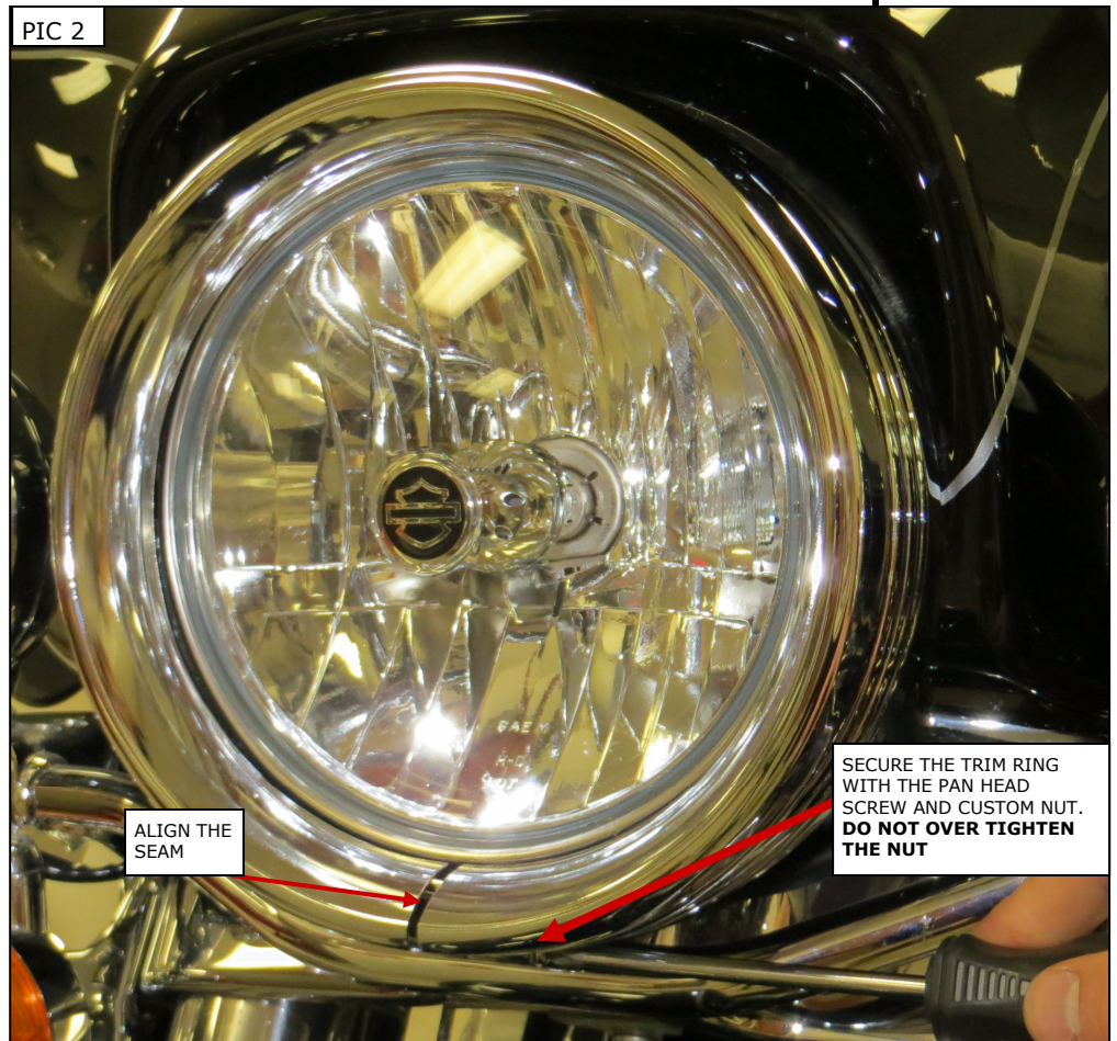
PIC 2 ALIGN THE SEAM